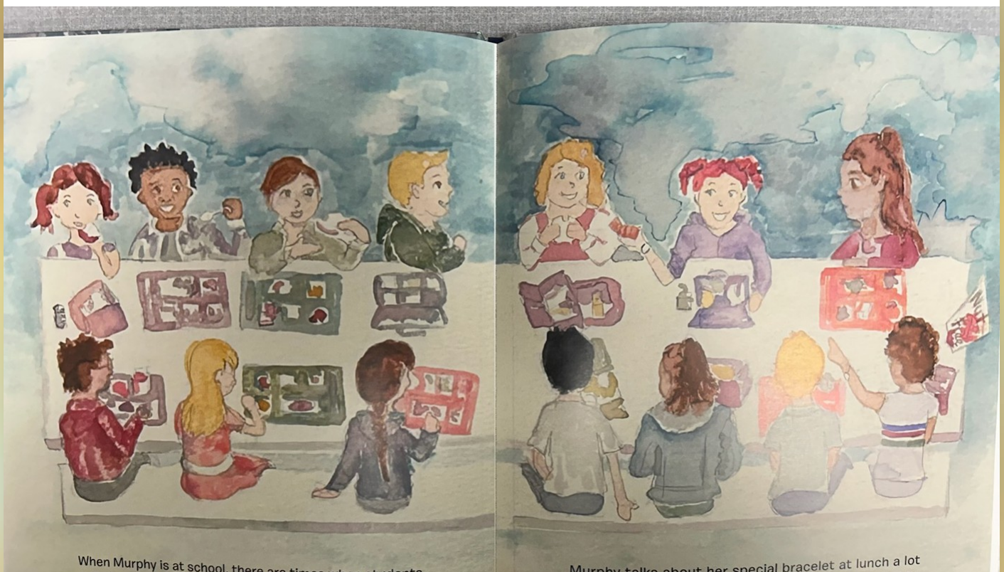
When Murphy is at school, there are times when students